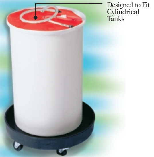
TC Tech 100 Liter Standard in Cylindrical Tank

TC Tech 50 Liter, 100 Liter, 200 Liter, 300 Liter Sterile Fluid Handling Bags accommodate fluid volumes associated with pilot plant work and full scale production. Typical applications include media storage, buffer storage and purified water storage. Standard bags are designed to fit in cylindrical tanks such as NALGENE® tanks. Custom configurations available to fit your existing container.