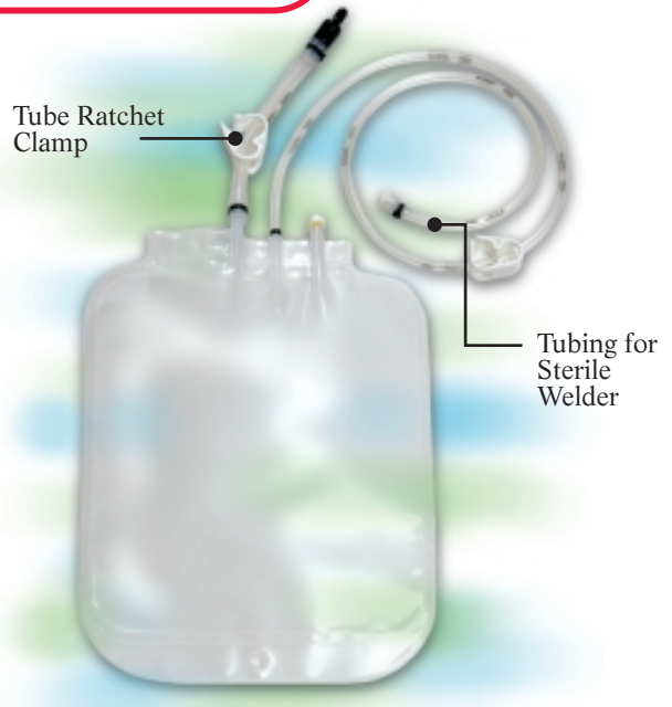
TC Tech 2 Liter SCD®

TC Tech 60ml, 300ml, 1 Liter, 2 Liter Sterile Fluid Handling Bags are ideal for small volume bench-top work. Typical applications include specialty media dispensing and final product storage. Well suited for QC sampling in a manifold system. Hanger port facilitates complete drainage. May be frozen to -30°C. Consult TC Tech for recommendations on handling frozen bags.