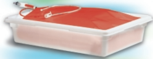
TC Tech 20 Liter Bag in Tray

TC Tech will design and manufacture Sterile Fluid Handling Bags or Liners to fit your existing container. TC Tech can design bags to fit trays, stackable bins, drums, conical bottom tanks, cylindrical tanks and totes. Your TC Tech Representative will work with you to gather needed measurements and discuss application requirements. TC Tech Engineering will thoroughly review each application, make recommendations, and provide drawings of proposed design.