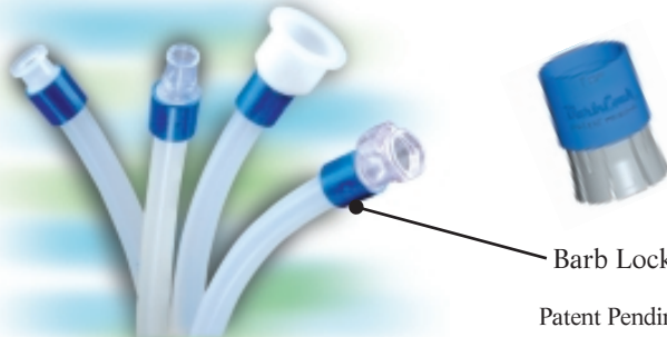
BarbLock on Couplings by Colder Products and Sanitary Fittings by Saint-Gobain