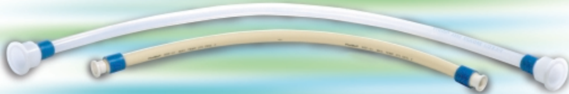
BarbLock Pump & Transfer Hose Assemblies

BarbLock Ultra-Secure Tubing Retainer provides a high performance alternative to cable ties. A 360° radial crimp behind the barb provides up to 7 times* the pull-off resistance of cable ties. A 360° seal over the barb offers leak protection not found with cable ties. BarbLock is recommended for use with C-Flex®, Silicone, Pharmed, and PVC tubing products. Available on TC Tech Sterile Fluid Handling Bags, as Pump & Transfer Hose assemblies, or for individual sale. Custom sizes available to fit your existing barbed fitting.